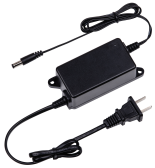
PFM321 Power Adapter