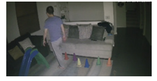
Smart Illumination mode: White light LED triggered only when a person is detected. Remain IR mode otherwise for power saving and less disturbance.