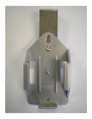
Fig. 2 Walk-Tester holder and bracket