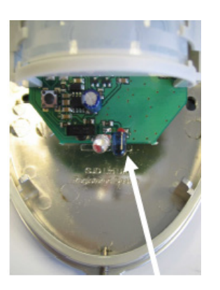
Fig.1 Detector's IR emitter

*To verify that your detector is compatible with the Walk-Tester, remove the cover and look at the bottom of the circuit board for a blue IR LED (see figure 1 below). If the blue LED is present, the Walk-Tester will be able to communicate with the detector.