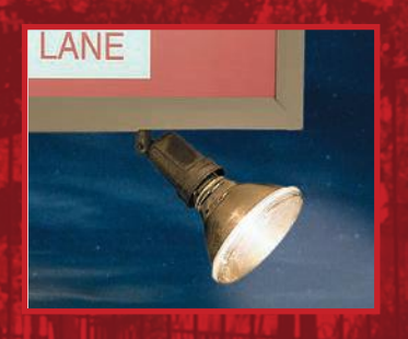
Flood Lamp for spike illumination