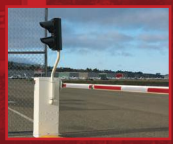
Synchronizes with most vehicular gate and barrier operators