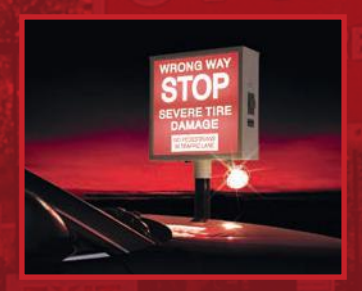
Light Sensor automatically turns sign on at dusk, off at dawn