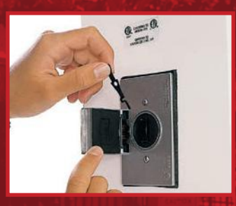
Keyed on/off switch allows sign to be turned on or off manually

GATED COMMUNITIES • PARKING • CONDOMINIUM/ RESIDENT HALL • MIXED USE • COMMERCIAL • SELF STORAGE • MAXIMUM SECURITY