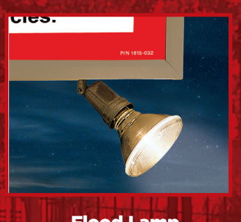
Flood Lamp for spike illumination