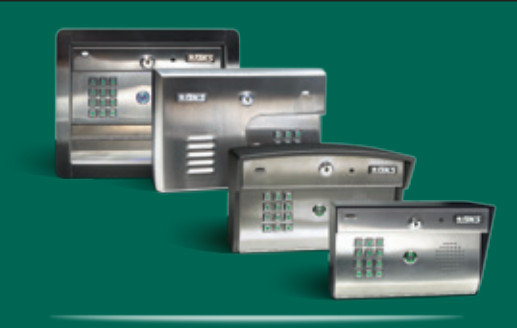
Mounting Styles All models available in flush, surface, or wall styles. AccessPlus and Plus models shown.