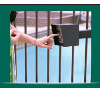
Additional Access Point Control* Access point control with keypads, card readers or RF receiver .* for use with 1812 Access Plus