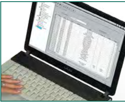
pc programmable Program the 1812 Access Plus from your PC